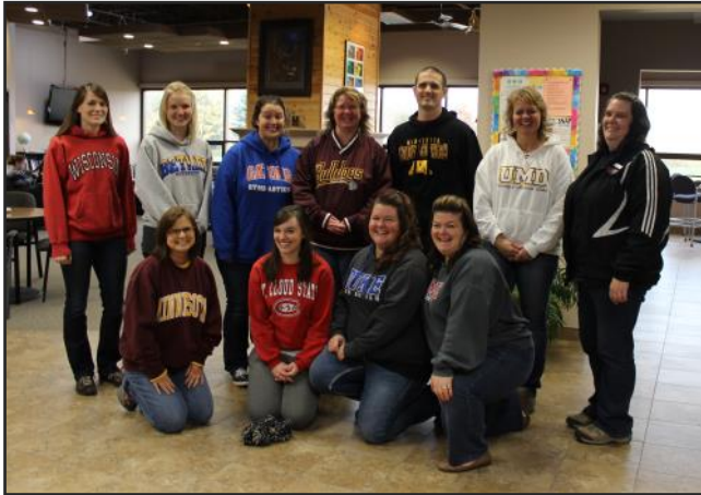
Wolf Creek Staff happily display their college alumni wear.